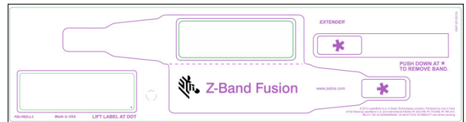
Part Number: FID-PED-L3-1-200T