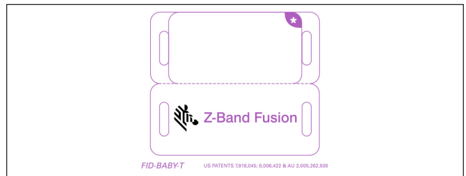
Part Number: FID-BABY-T-1-500

For more information about the Z-Band Fusion, visit www.zebra.com/wristbands or access our global contact directory at www.zebra.com/contact